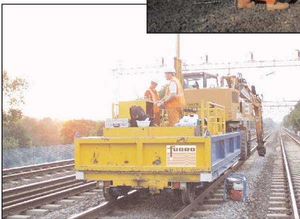
VAB Certified CPT Rail Rig