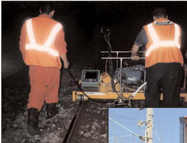
GPR EMC Certified

Fugro are able to offer a wide range of trackbed & geotechnical investigation services including Geophysical investigations using Ground Probing Radar (GPR), Shallow Sampling - Automatic Ballast Sampling (known as ABS) to very deep investigation holes down to 30m depth. The methods of trackbed and subgrade (soil) investigation are tailored to the limited track access times, using Cone Penetration Testing (CPT) as well as rapid drilling methods using low headroom rigs.