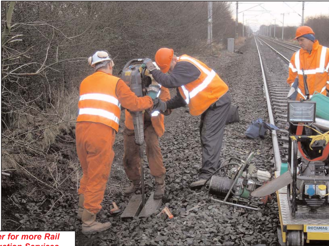
See over for more Rail Investigation Services